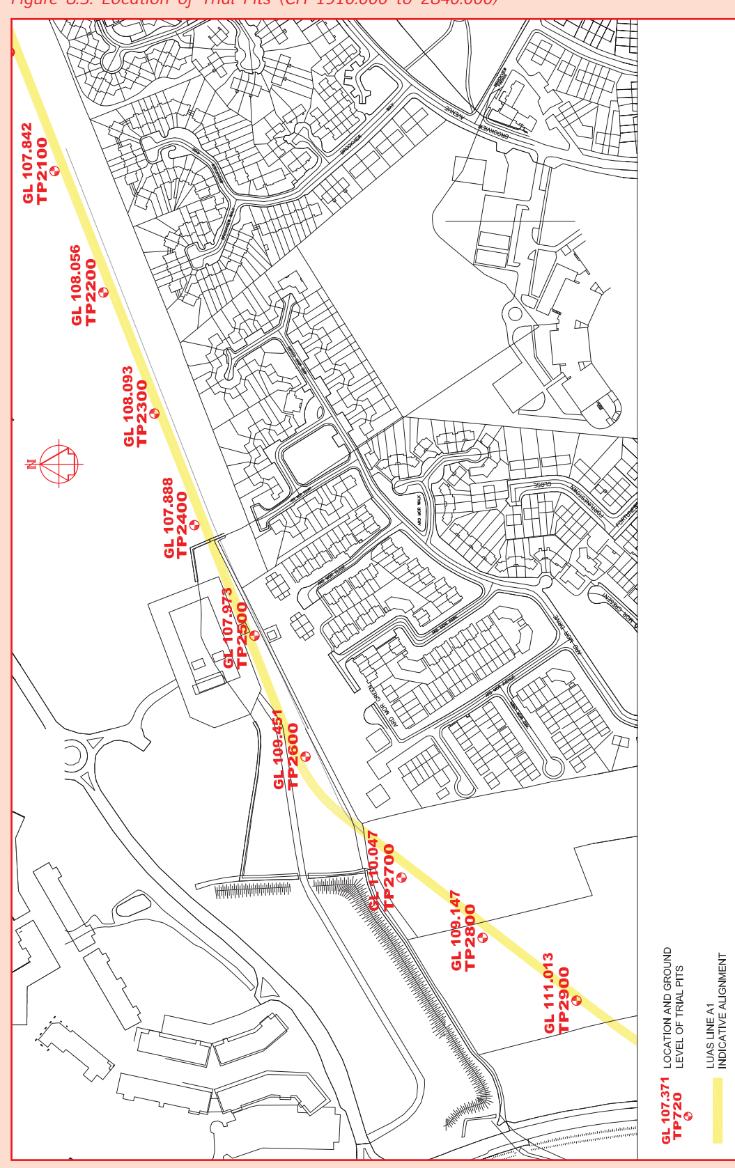
Figure 8.3: Location of Trial Pits (CH 1910.000 to 2840.000)